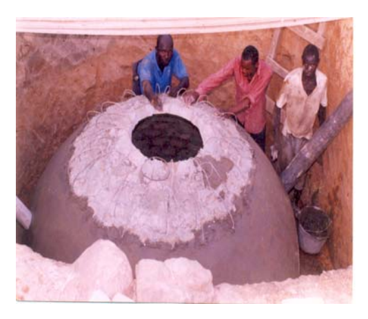
Biogas production in Kayes, Mali. Via this digester, cow dung is used to produce biogas.

Vulnerability Assessment of Coastal Areas and Fishing, Togo. This study was carried out in 2000 within the framework of the United Nations Framework Convention on Climate Change. The study gives an analysis on the vulnerability of the Togolese coastal zone and the areas close to it, and addresses potential methods of adaptation.