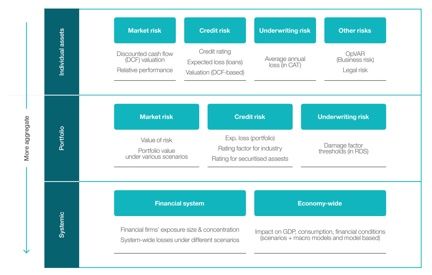
Figure 3. Categorisation of environmental risk tools (BOE et al., 2017)