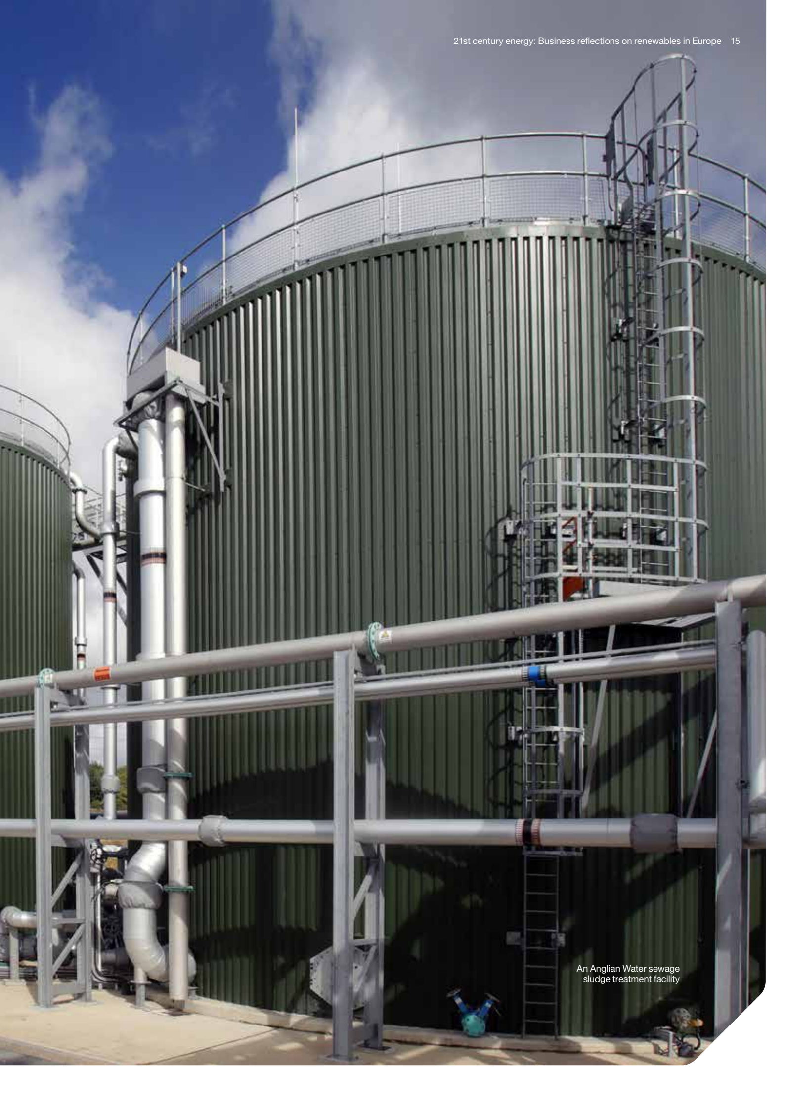
An Anglian Water sewage sludge treatment facility