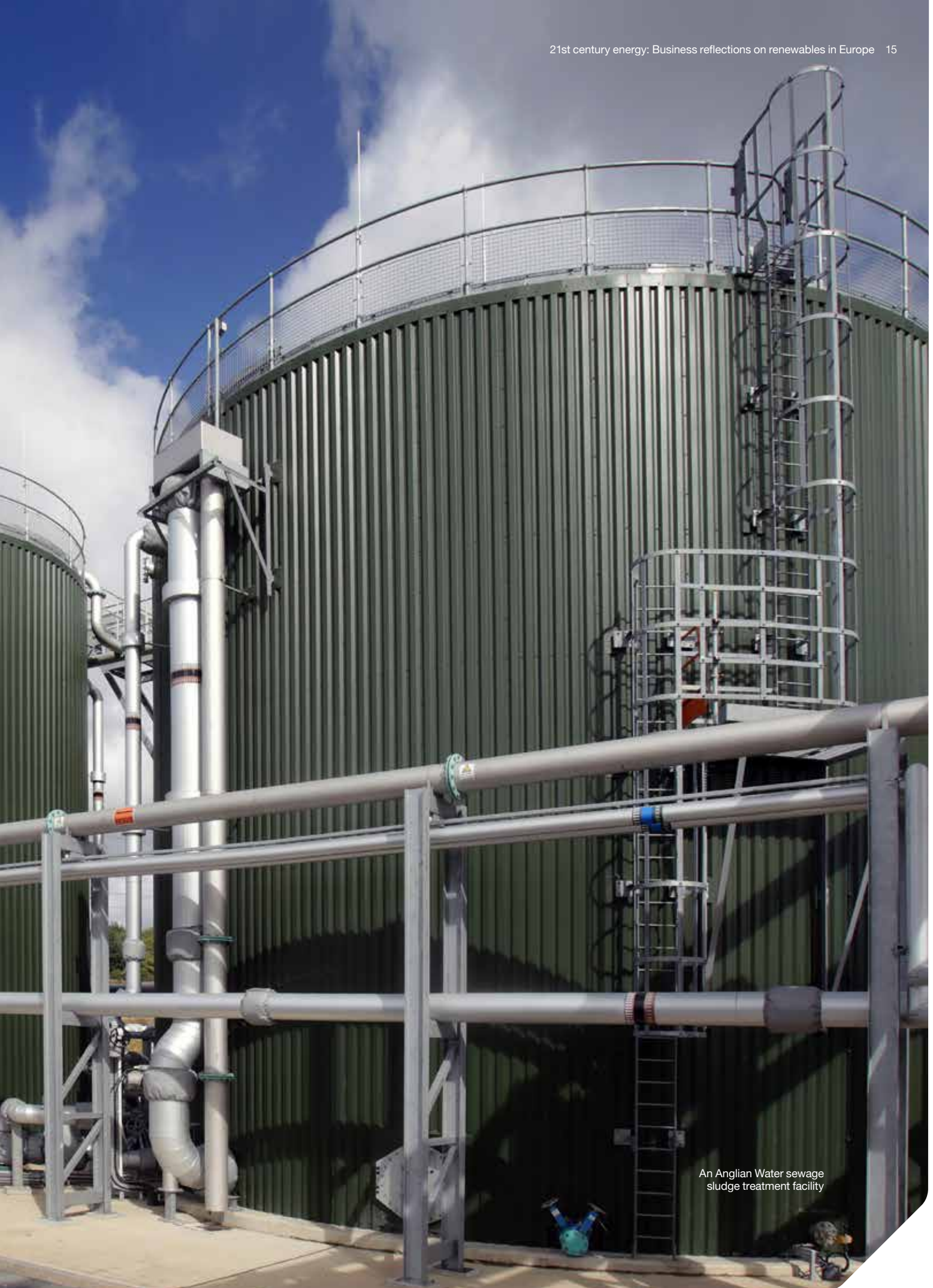
An Anglian Water sewage sludge treatment facility